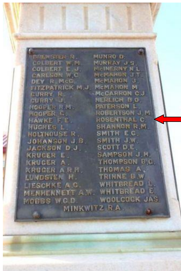
Kapunda War Memorial